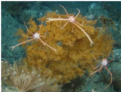
A large Atlantic black coral. Recent work shows that these black corals may live over 2000 years.